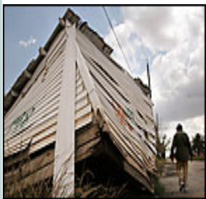
Katrina Disaster Photo

Disparities in wealth and in the distance of evacuees from their ruined houses are dictating, in many cases, which neighborhoods will be part of New Orleans's future and which will be consigned to its history.