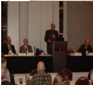
AARO 2006 Fall Conference

Disparities in wealth and in the distance of evacuees from their ruined houses are dictating, in many cases, which neighborhoods will be part of New Orleans's future and which will be consigned to its history.